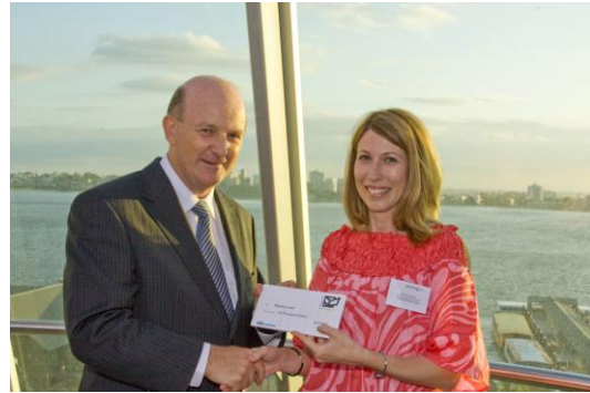
Hon John Day MLA, Minister for Culture & the Arts, and Natasha Lester, 2008 T.A.G. Hungerford Award winner

writingWA was pleased to support this AWG WA initiative, playing a minor but important role in the seminar by bringing WA publishers Gestalt and Fremantle Press into the programme to discuss opportunities for adapting published material for the screen.