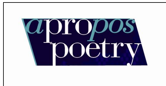
Apropos Poetry Conference, Feb 2009