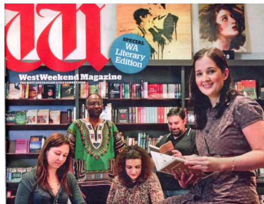
The West Australian Weekend Magazine Literary Supplement, Sept 2009